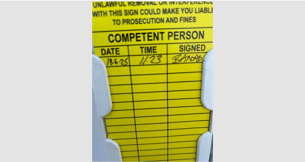
00001-DN1:Inspection Photo (18/06/25 11:26)