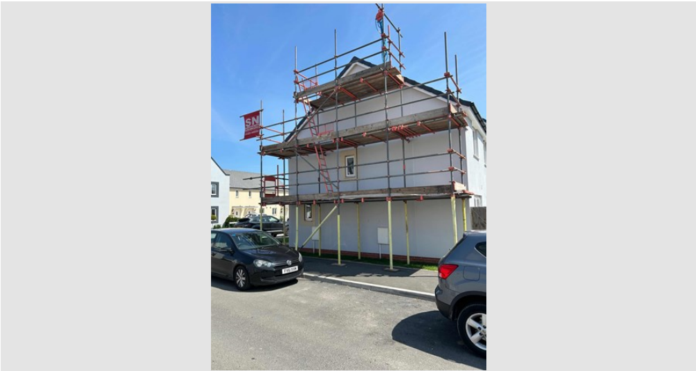
00001-DN1:Inspection Photo (18/06/25 11:26)