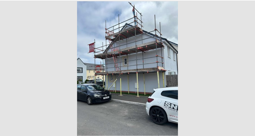
00001-DN1:Inspection Photo (25/06/25 11:44)