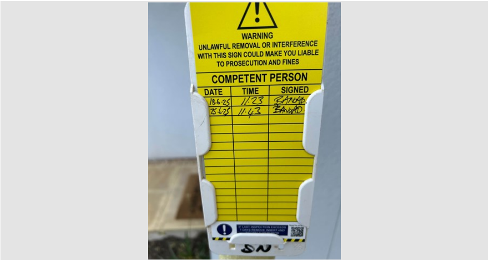
00001-DN1:Inspection Photo (25/06/25 11:44)