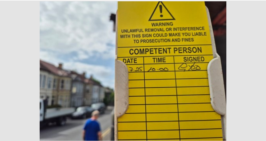
00001-DN1:Inspection Photo (24/07/25 10:25)