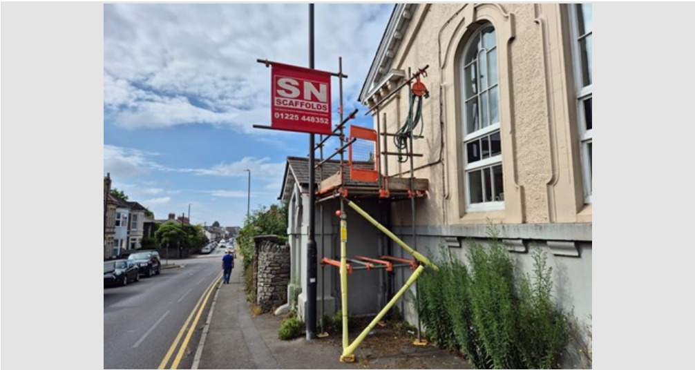
00001-DN1:Inspection Photo (24/07/25 10:25)