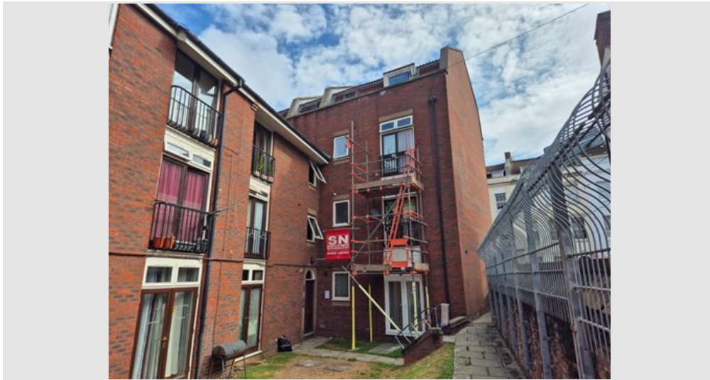
00001-DN1:Inspection Photo (24/07/25 10:44)