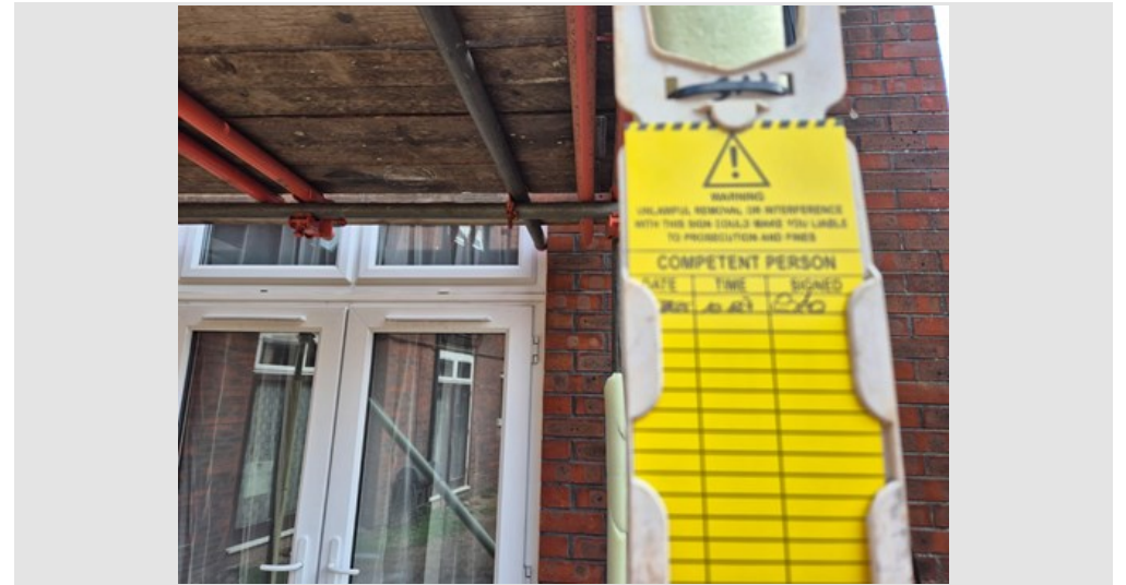
00001-DN1:Inspection Photo (24/07/25 10:44)