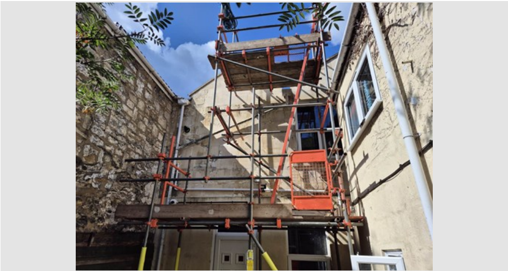
00001-DN1:Inspection Photo (28/07/25 10:41)