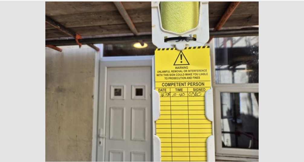
00001-DN1:Inspection Photo (28/07/25 10:41)