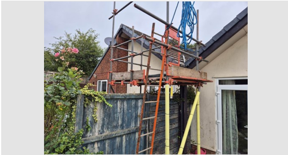
00001-DN1:Inspection Photo (29/07/25 11:17)