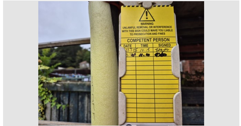
00001-DN1:Inspection Photo (29/07/25 11:17)