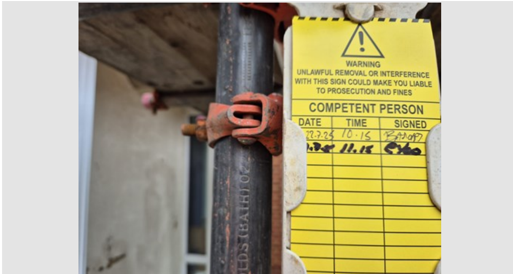
00001-DN1:Inspection Photo (29/07/25 11:17)