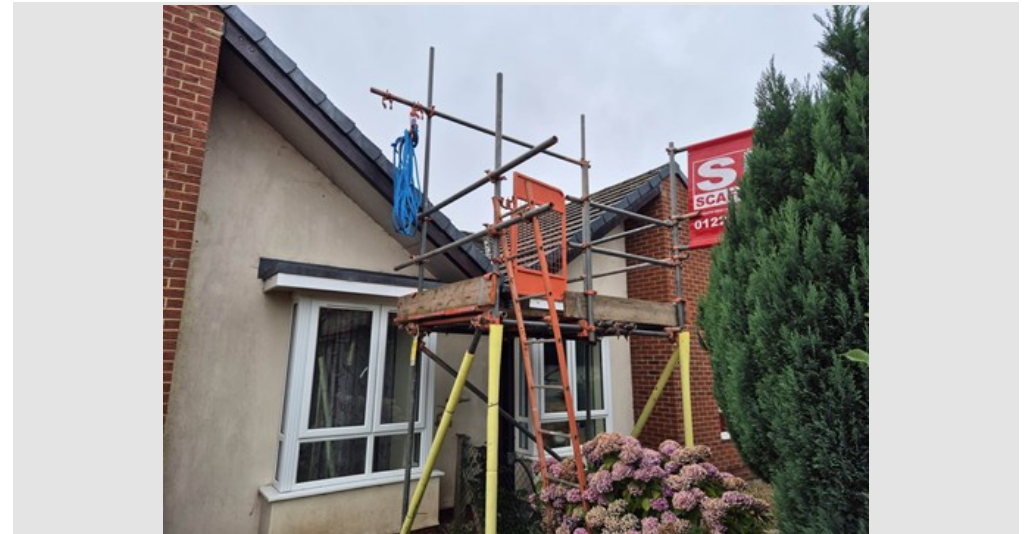
00001-DN1:Inspection Photo (29/07/25 11:17)