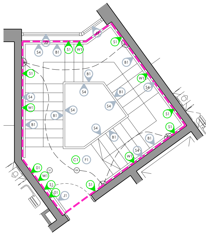
PROPOSED FIRST & SECOND FLOOR STAIR 1 LAYOUT (1:50 @ A2)