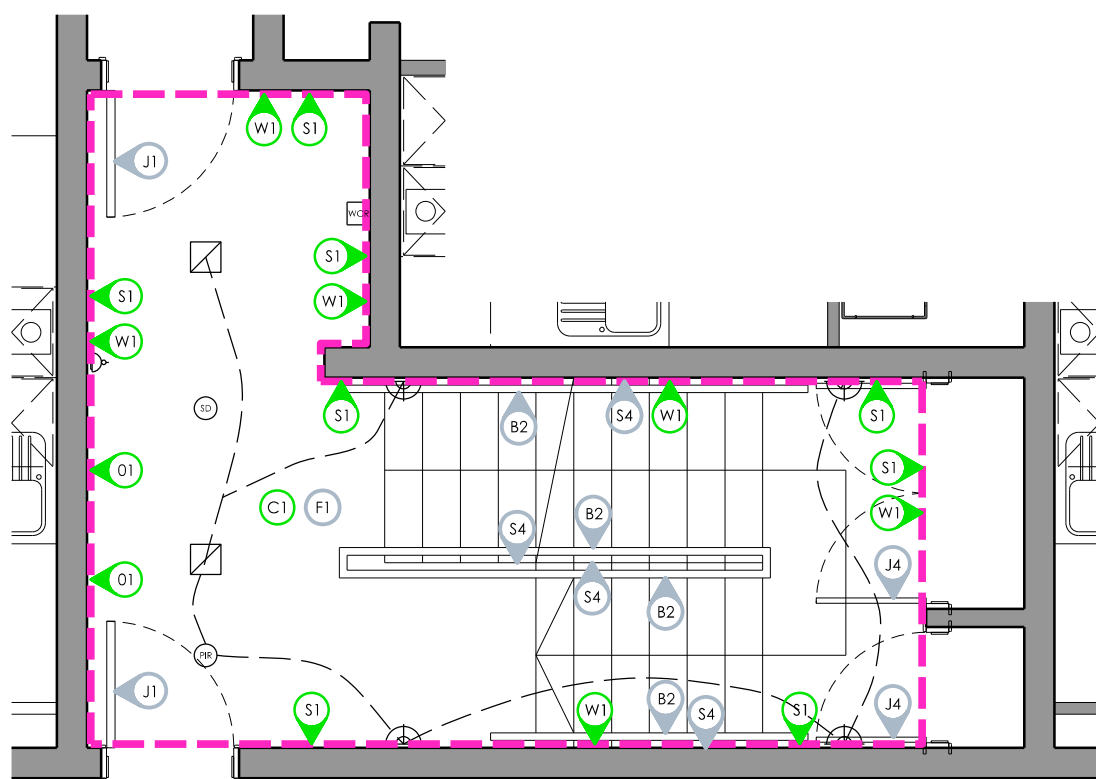
PROPOSED FIRST & SECOND FLOOR STAIR 3 LAYOUT (1:50 @ A2)